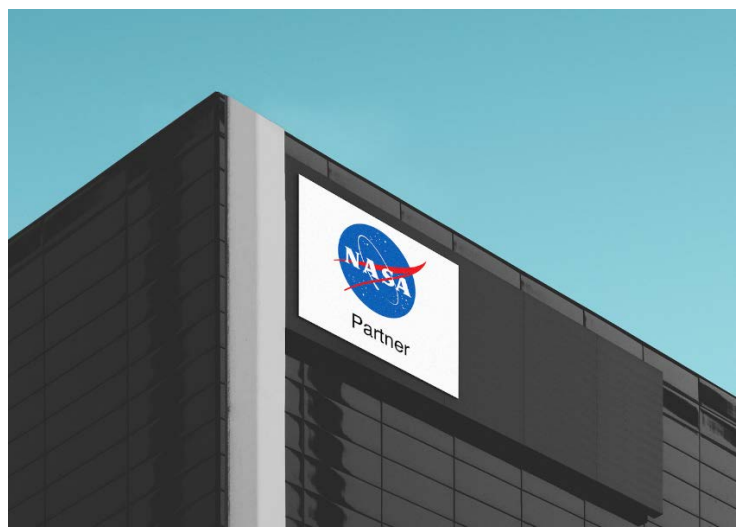
Figure 4: Building (without disclaimer)

• Markings on buildings or signage for buildings wherein NASA-funded activities are occurring under a grant or cooperative agreement. See Figure 4 below: