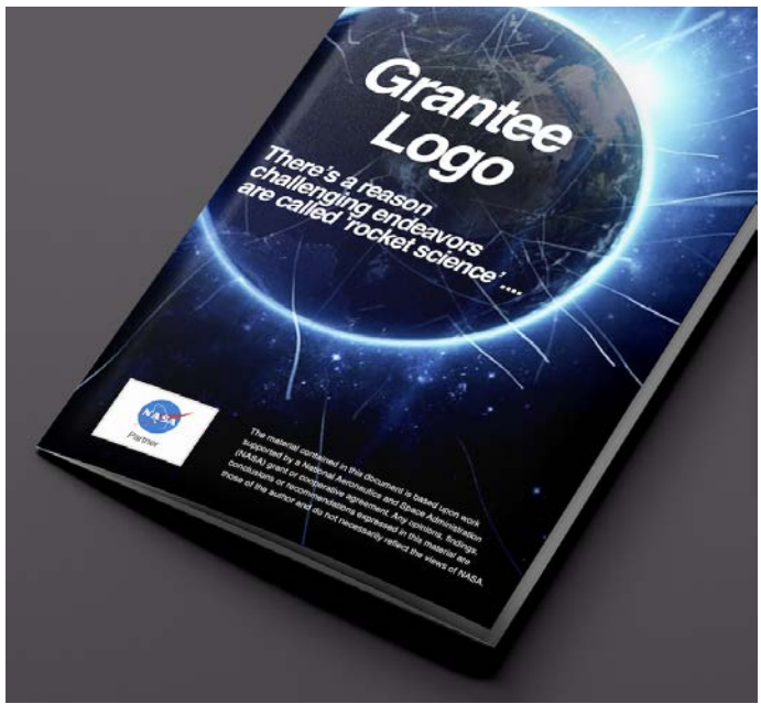
Figure 3: Brochure (with disclaimer)

Use where a Disclaimer Statement is Not Required: