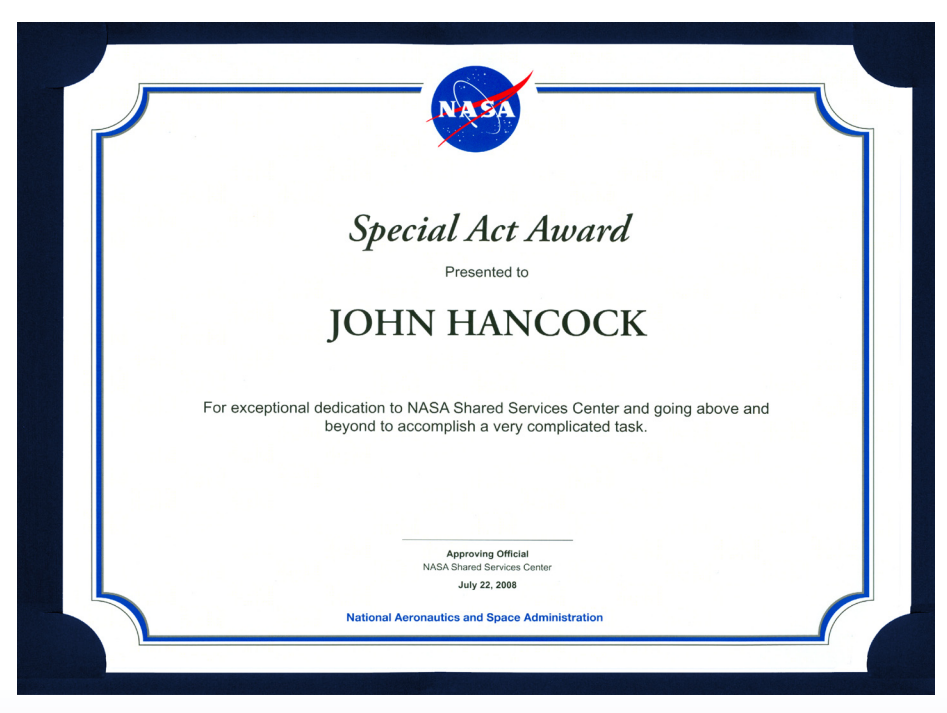
Individual 8.5x11 Center Other Certificate