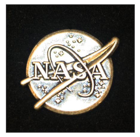
15 Year Pin - Gold