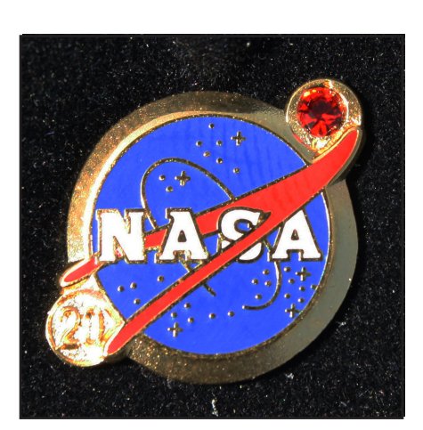
20 Year Pin - Red Stone