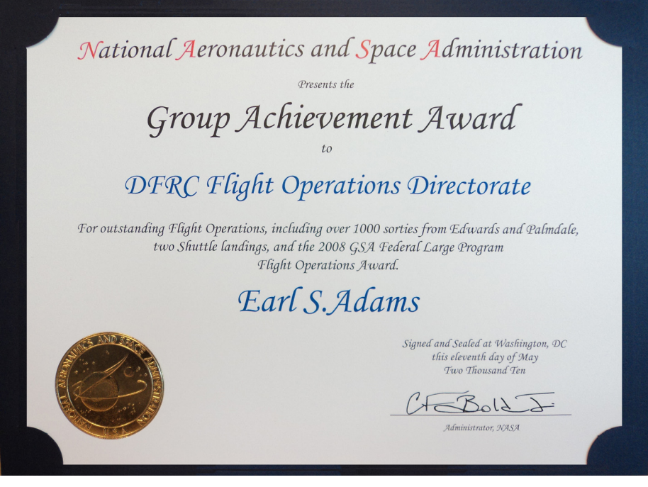
Group Member 8.5x11 Agency Honor Certificate