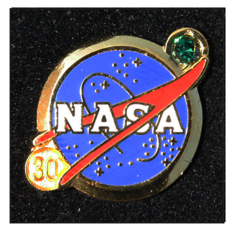
30 Year Pin - Green Stone