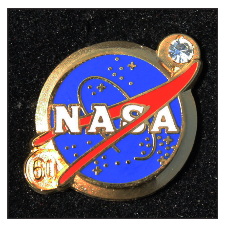
60 Year Pin - Clear Stone