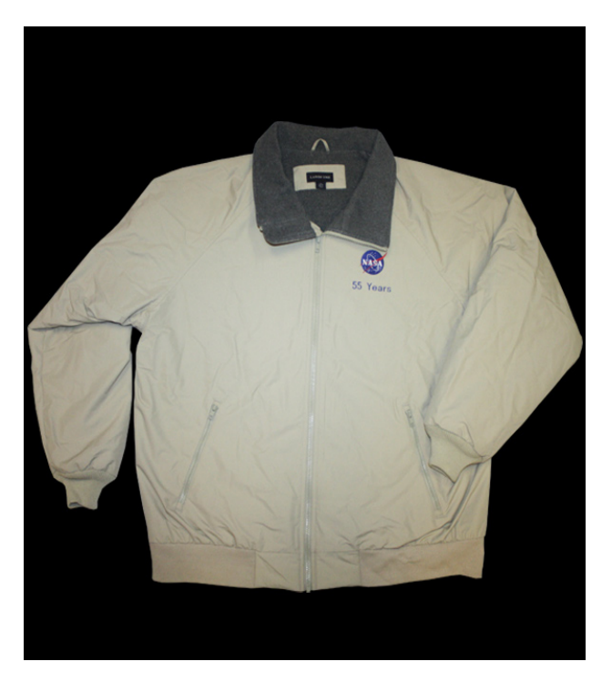
55 Year Memento – Personalized jacket with the name of the recipient and the NASA logo.