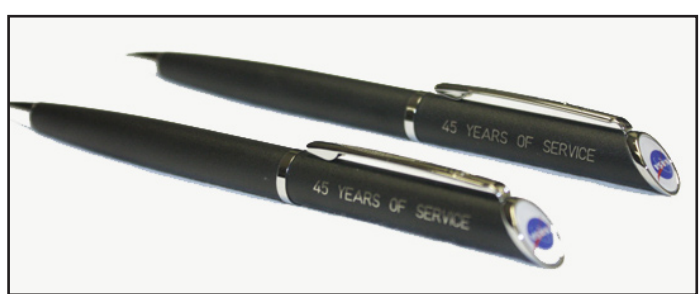
45 Year Memento – Pen set with NASA logo.