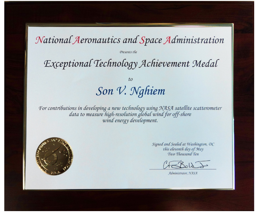
Framed Individual Agency Honor 11x14 Certificate