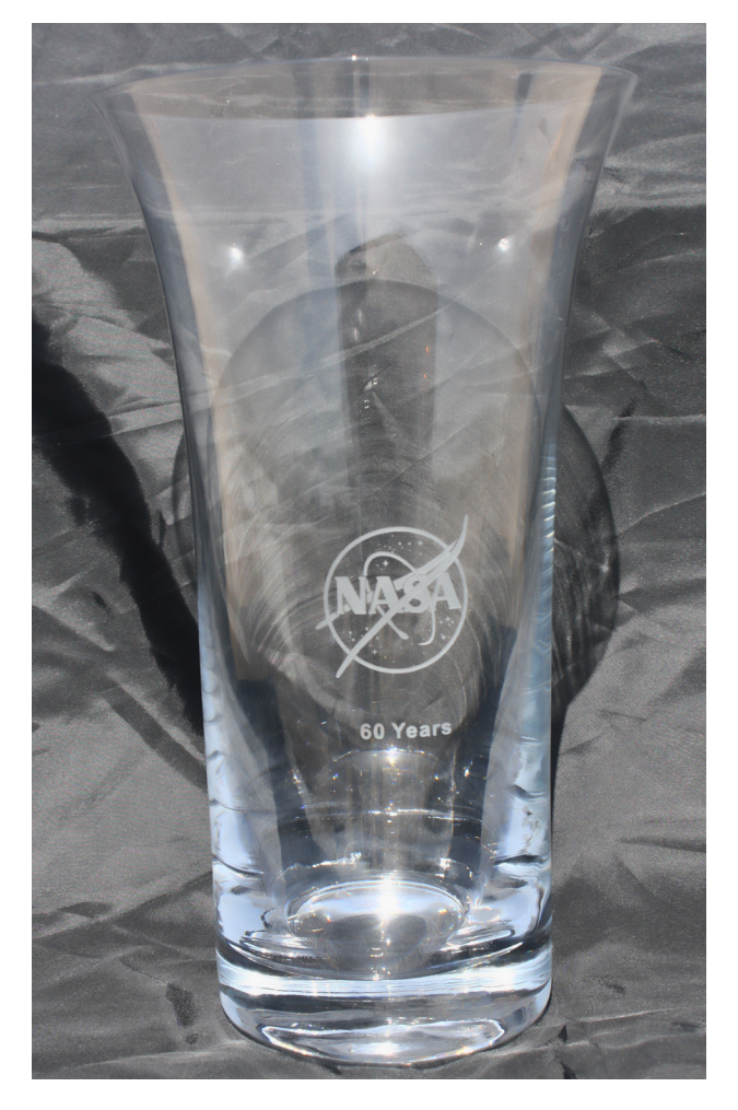
60 Year Memento – Recipient has their choice of: A crystal vase with the NASA logo