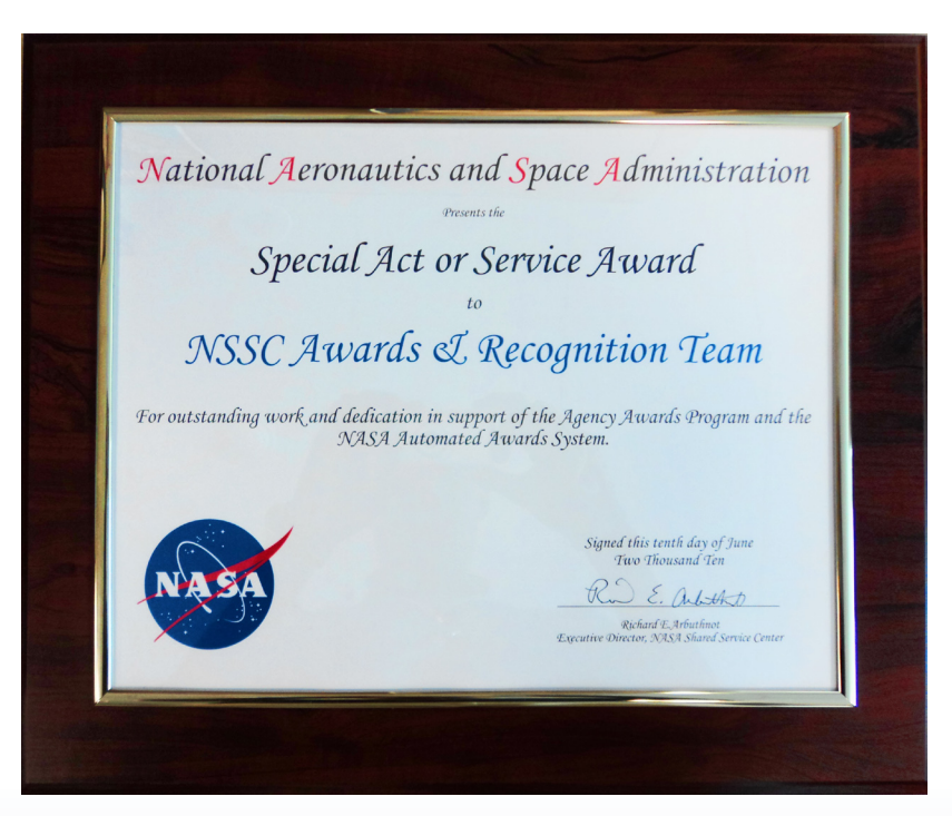
Framed Individual Center Honor 11x14 Certificate