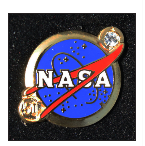
50 Year Pin - Clear Stone