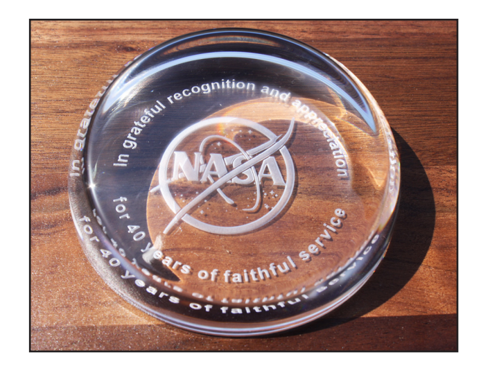
40 Year Memento – Crystal paper weight with NASA logo.