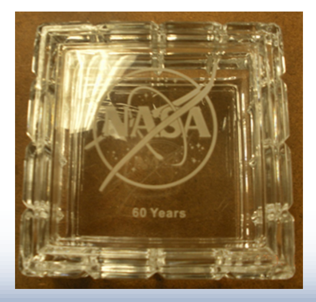
60 Year Memento – Recipient has their choice of: A crystal memory box with the NASA logo