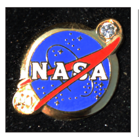
40 Year Pin - Clear Stone