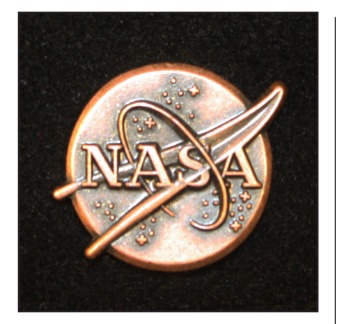
5 Year Pin - Bronze