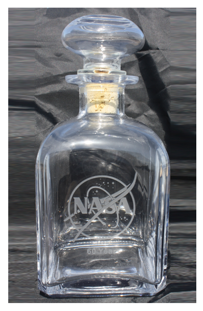
60 Year Memento – Recipient has their choice of: A crystal decanter with the NASA logo