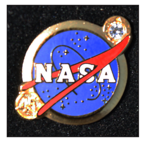
45 Year Pin - Clear Stone