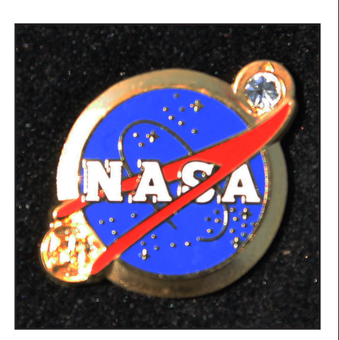
55 Year Pin - Clear Stone