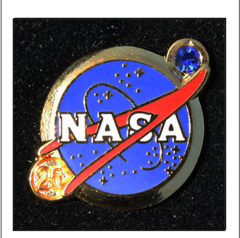
25 Year Pin - Blue Stone