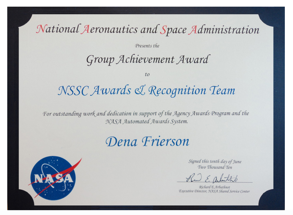
Group Member 8.5x11 Center Honor Certificate