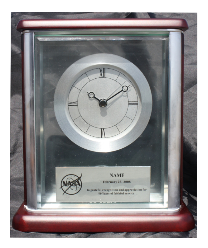
50 Year Memento – Personalized clock with the name of the recipient, anniversary date, and the NASA logo.