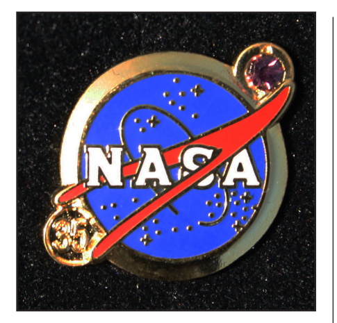
35 Year Pin - Purple Stone