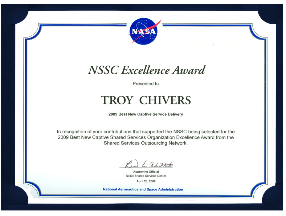
Group Member 8.5x11 Center Other Certificate