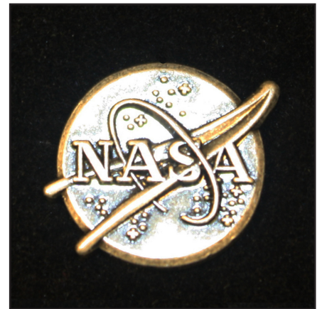
15 Year Pin - Gold