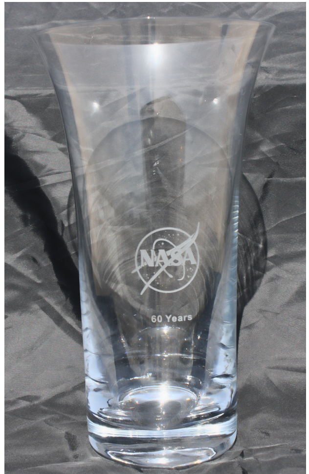
60 Year Memento – Recipient has their choice of: A crystal vase with the NASA logo