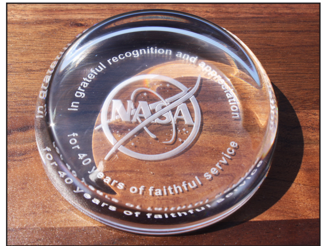
40 Year Memento – Crystal paper weight with NASA logo.