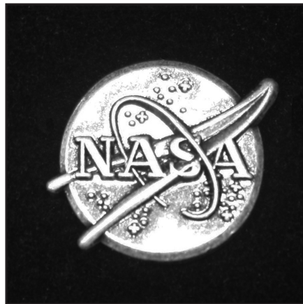
10 Year Pin - Silver