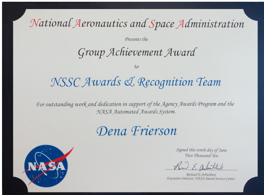
Group Member 8.5x11 Center Honor Certificate