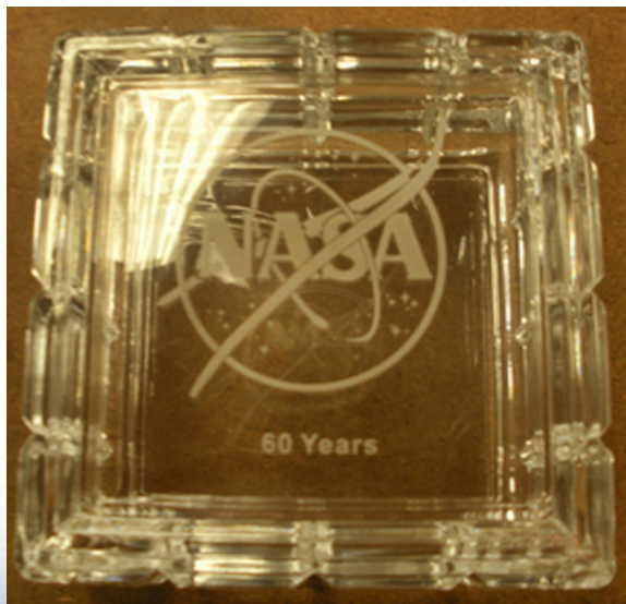
60 Year Memento – Recipient has their choice of: A crystal memory box with the NASA logo