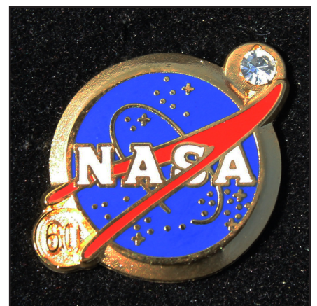
60 Year Pin - Clear Stone