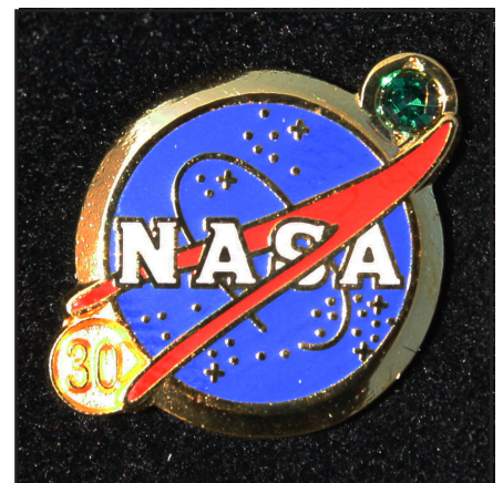
30 Year Pin - Green Stone