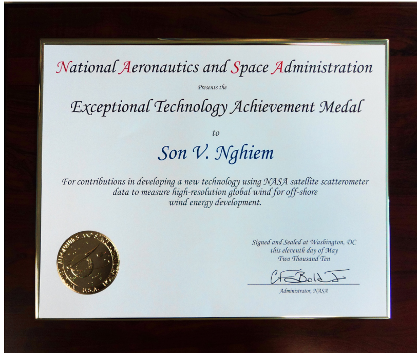
Framed Individual Agency Honor 11x14 Certificate