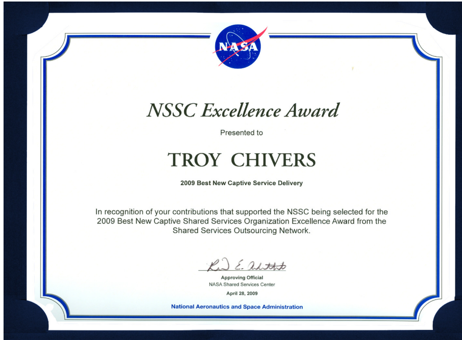
Group Member 8.5x11 Center Other Certificate