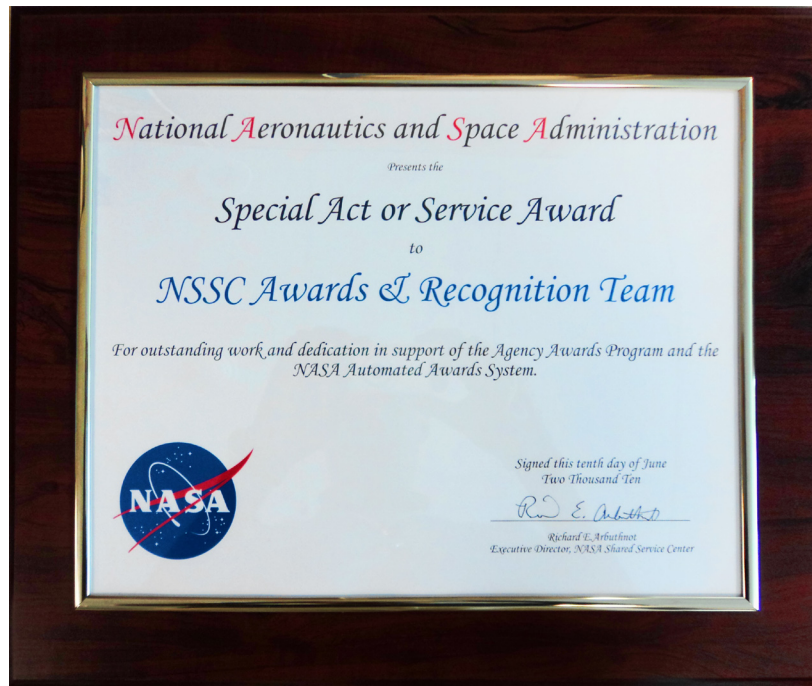
Framed Individual Center Honor 11x14 Certificate