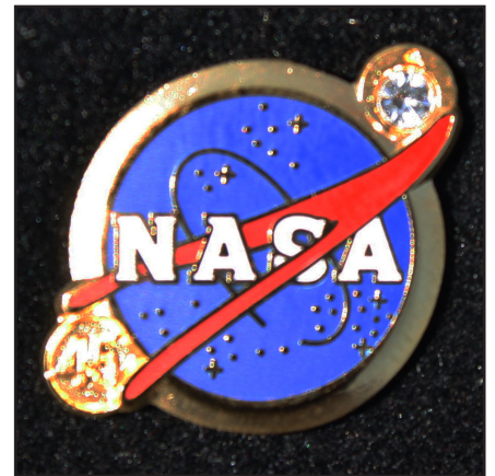
45 Year Pin - Clear Stone