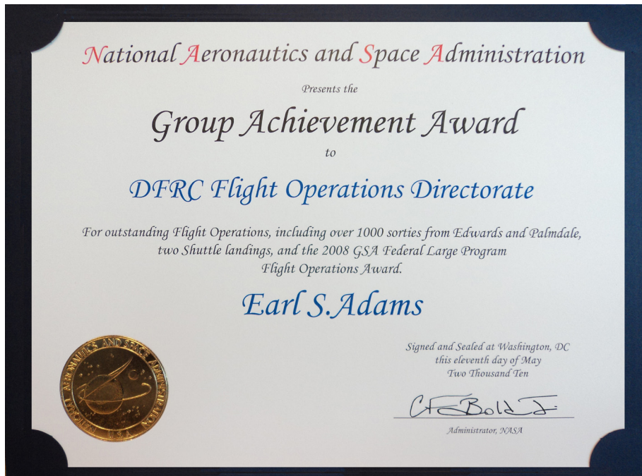
Group Member 8.5x11 Agency Honor Certificate