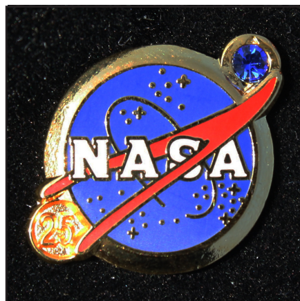
25 Year Pin - Blue Stone