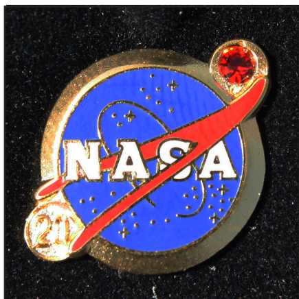
20 Year Pin - Red Stone