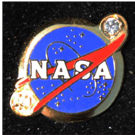
40 Year Pin - Clear Stone