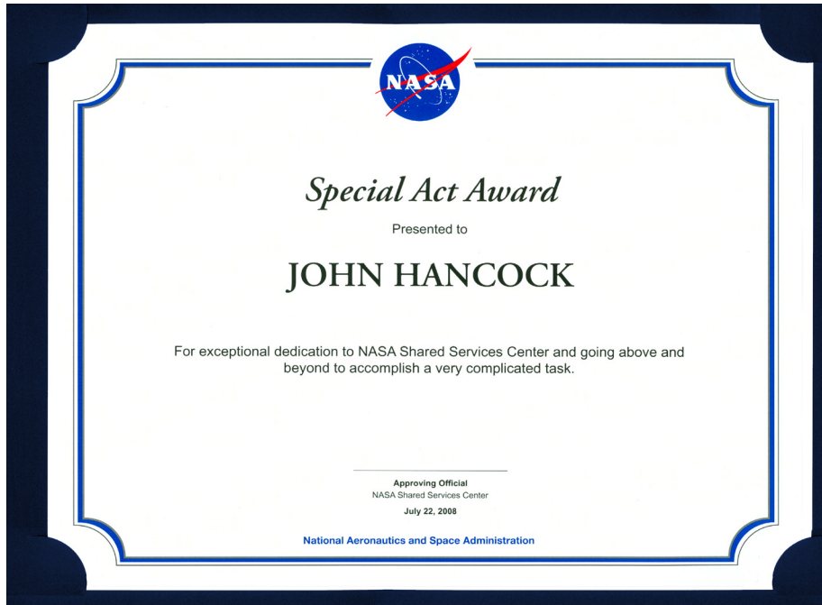
Individual 8.5x11 Center Other Certificate