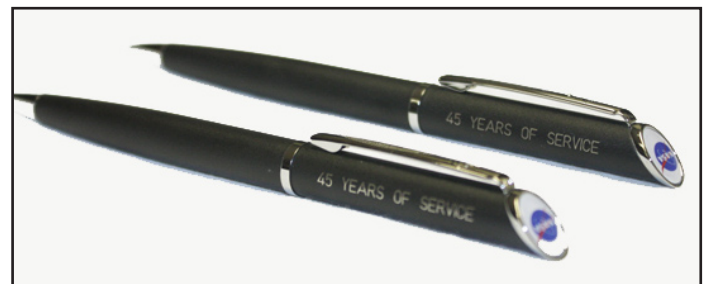
45 Year Memento – Pen set with NASA logo.