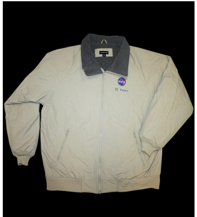
55 Year Memento – Personalized jacket with the name of the recipient and the NASA logo.