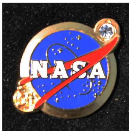
55 Year Pin - Clear Stone