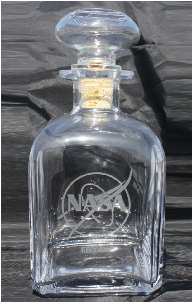
60 Year Memento – Recipient has their choice of: A crystal decanter with the NASA logo