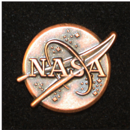
5 Year Pin - Bronze