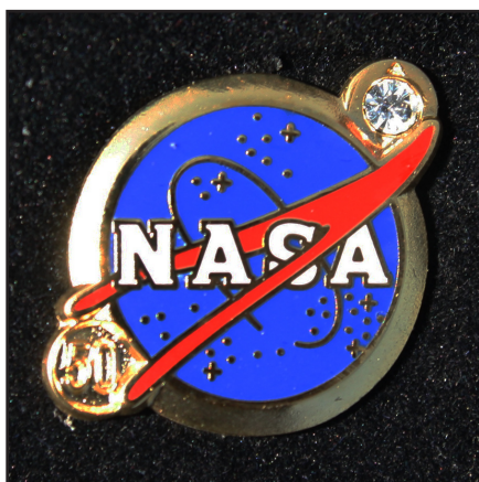
50 Year Pin - Clear Stone