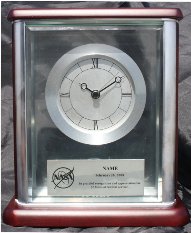
50 Year Memento – Personalized clock with the name of the recipient, anniversary date, and the NASA logo.