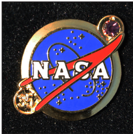
35 Year Pin - Purple Stone