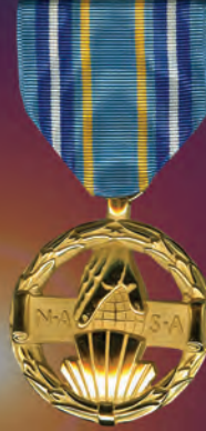
EXCEPTIONAL TECHNOLOGY ACHIEVEMENT MEDAL