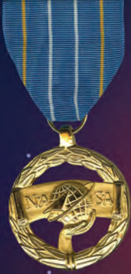
EXCEPTIONAL ENGINEERING ACHIEVEMENT MEDAL