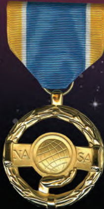
EXCEPTIONAL PUBLIC SERVICE MEDAL