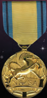
EARLY CAREER ACHIEVEMENT MEDAL