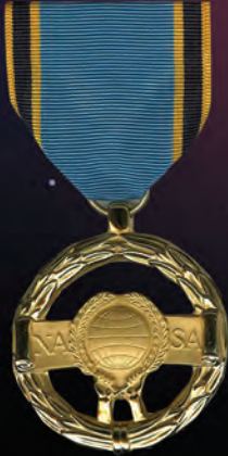
EXCEPTIONAL SERVICE MEDAL