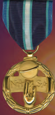
EXCEPTIONAL SCIENTIFIC ACHIEVEMENT MEDAL