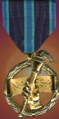
OUTSTANDING LEADERSHIP MEDAL