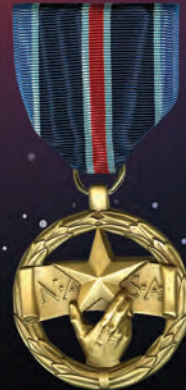
EXCEPTIONAL BRAVERY MEDAL