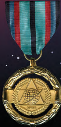
EXCEPTIONAL ACHIEVEMENT MEDAL