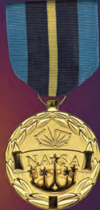
OUTSTANDING PUBLIC LEADERSHIP MEDAL