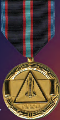
SPACE FLIGHT MEDAL