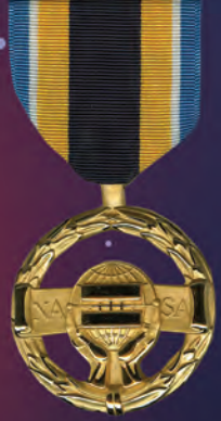
EQUAL EMPLOYMENT OPPORTUNITY MEDAL