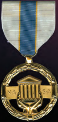
EXCEPTIONAL ADMINISTRATIVE ACHIEVEMENT MEDAL